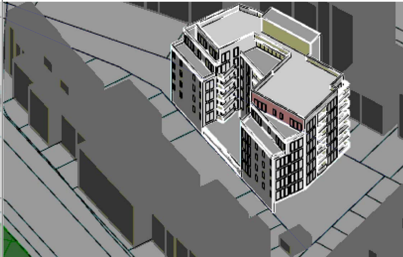
2 AXONOMETRIC DIAGRAMS