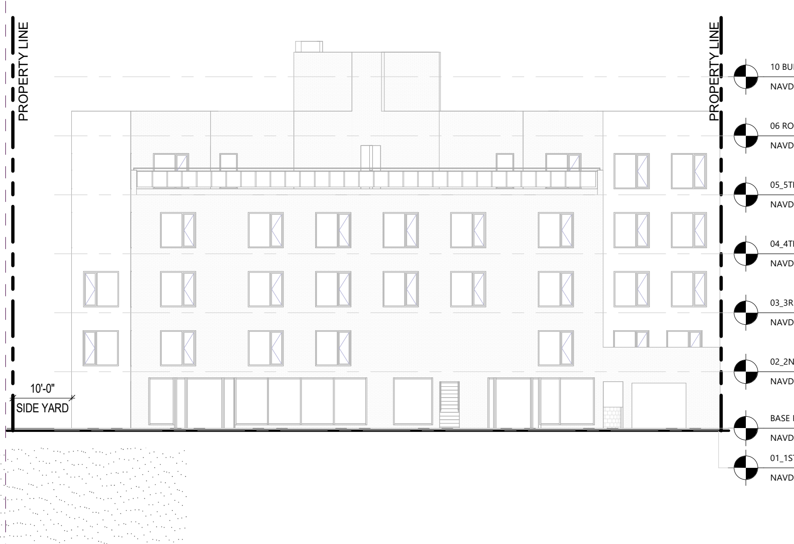
5 YARD DIAGRAM 1/16" = 1'-0"