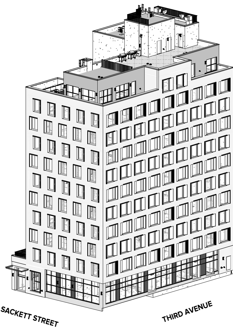
AXON DIAGRAM (CORNER OF SACKETT ST AND THIRD AVE)